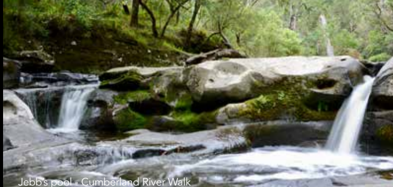
Jebb's pool - Cumberland River Walk